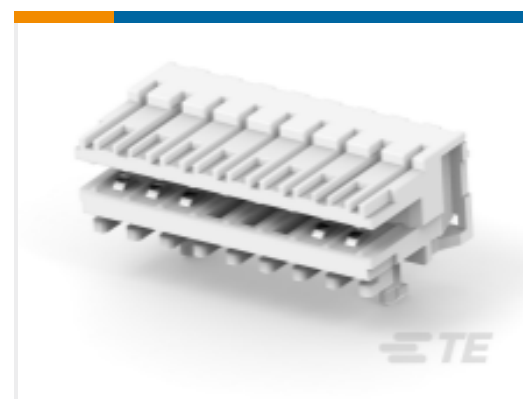
TE Part # 4-1534798-8 DUOPLUG MK II CONNECTOR3-20P SELEK LOAD