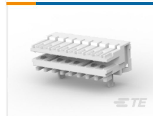
TE Part # 8-1534798-8 DUOPLUG MK II CONNECTOR3-20P SELEK LOAD