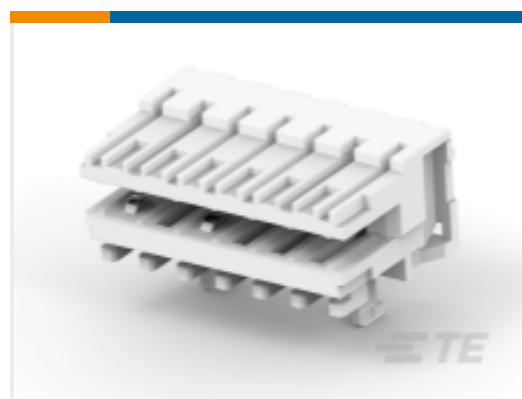
TE Part # 4-1534798-6 AMP DUOPLUG MK II CON. 3-20 POS. SELECTIV