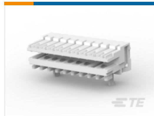
TE Part # 6-1534798-9 AMP Duoplug 2,5 MK II selektive loaded