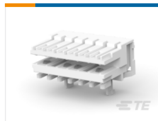
TE Part # 5-1534798-6 AMP DUOPLUG MK II CON. 3-20 POS. SELECTIV