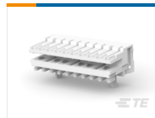
TE Part # 5-1534798-9 AMP Duoplug 2,5 MK II selektiv