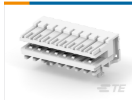
TE Part # 7-1534798-8 AMP DUOPLUG 2.5 MARK II FEMALE CONNECTOR