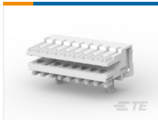
TE Part # 6-1534798-8 AMP DUOPLUG MARK II CONNECTOR SELE.LOAD